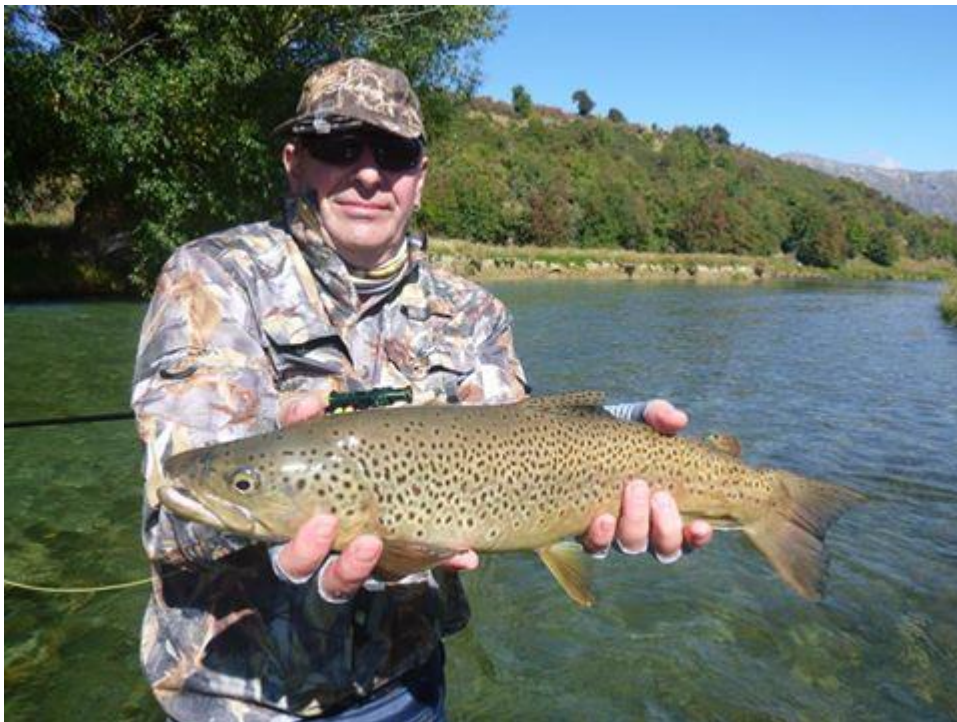
Paul's Southland Brown